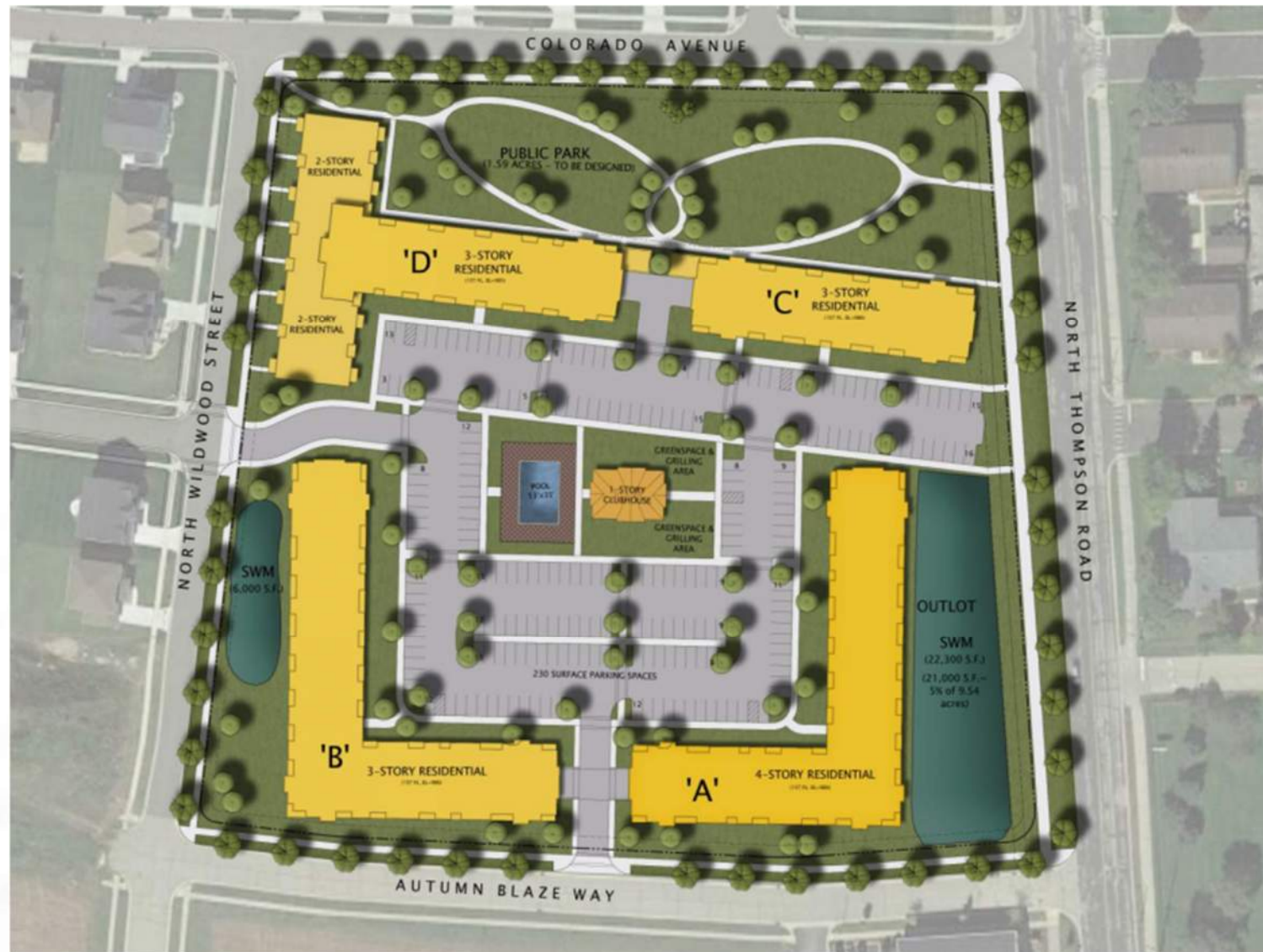
N. Wildwood St Entrance Site Plan